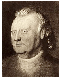
E. Waring (1736-1798)

Tensors have been introduced at the end of the nineteenth century with the development of the differential calculus. They have then been omnipresent in physics, to express laws independently of coordinate systems. Yet, a tensor is essentially a mapping from a linear space to another, whose coordinates transform multilinearly under a change of bases, as subsequently detailed. For an easier reading, we shall resort to arrays of coordinates, when this indeed eases presentation; interested readers may want to refer to [23], [49] for a more advanced coordinate-free presentation.