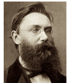
A. Clebsch (1833-1872)