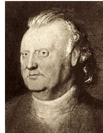
E. Waring (1736-1798)

Tensors have been introduced at the end of the nineteenth century with the development of the differential calculus. They have then been omnipresent in physics, to express laws independently of coordinate systems. Yet, a tensor is essentially a mapping from a linear space to another, whose coordinates transform multilinearly under a change of bases, as subsequently detailed. For an easier reading, we shall resort to arrays of coordinates, when this indeed eases presentation; interested readers may want to refer to [23], [49] for a more advanced coordinate-free presentation.