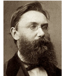
A. Clebsch (1833-1872)