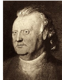
E. Waring (1736-1798)

Tensors have been introduced at the end of the nineteenth century with the development of the differential calculus. They have then been omnipresent in physics, to express laws independently of coordinate systems. Yet, a tensor is essentially a mapping from a linear space to another, whose coordinates transform multilinearly under a change of bases, as subsequently detailed. For an easier reading, we shall resort to arrays of coordinates, when this indeed eases presentation; interested readers may want to refer to [22], [48] for a more advanced coordinate-free presentation.