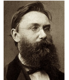
A. Clebsch (1833-1872)