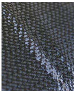
Detail (c) : wrinkle