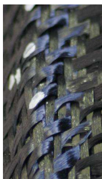
Detail (d) buckle