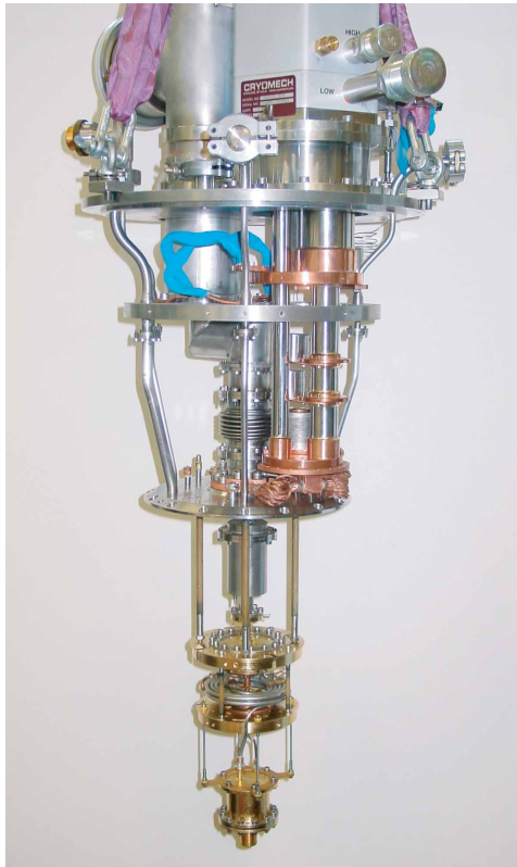
Fig. 1 (Color online) Cryogen-free dilution refrigerator . The main parts of the dilution unit, i.e. the mixing chamber, a continuous heat exchanger, the still and the Joule-Thomson exchanger are clearly visible, as well as the 4K and 60K plates connected to the pulse-tube cooler. The thermal shields and the 4K vacuum enclosure have been removed.

heat exchangers of large surface area designed with channel dimensions adapted to the nominal flow rate ensure reaching the desired temperature, from 20 mK down to less than 5 mK, depending on the number of step exchangers. PT-DR2, in the version described here, had only two small sintered silver heat exchangers; its design was optimised for flow rates in the range 0.1 - 0.3 millimoles/second.