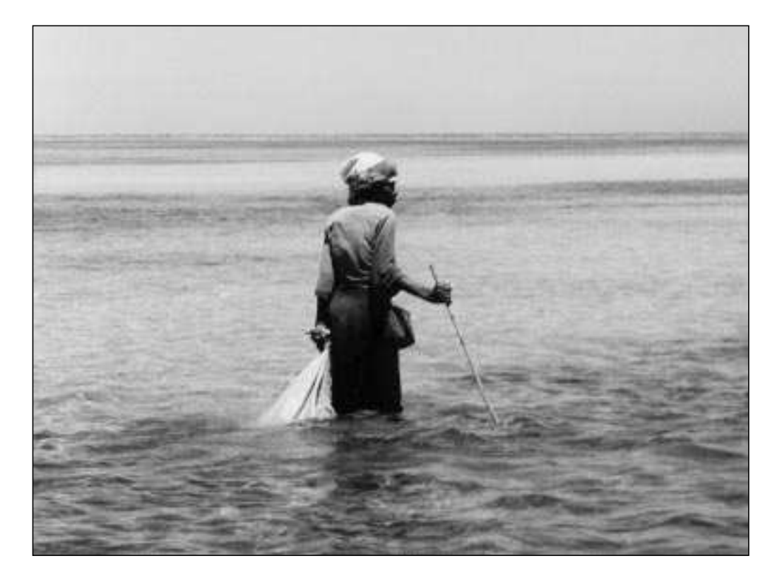
Figure 2 Collection at low tide on Toliara Barrier reef