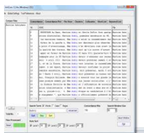
Graph 1 : KWIC abstract for Aubry's name in le Monde

ANTCONC enabled us to carry out a qualitative analysis since we can isolate blocks of text where the NPs are present; in this way we can visualize the contexts of use of any key word (see Graph 1 below, which illustrates what is defined as a key word in context or KWIC). A manual and selective reading is then possible.