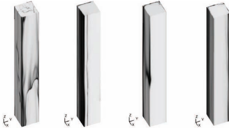
Figure 2: Instantaneous particle volume fraction field in the periodic circulating fluidized bed for different mesh resolutions. From right to left, the mesh resolution increases. White color corresponds to \alpha_p = 0 . Black color corresponds to \alpha_{p,max} = 0.64 .