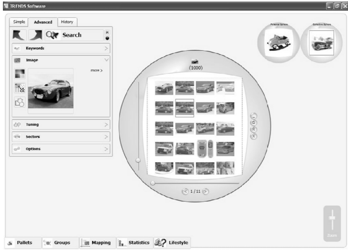
Figure 4: A global interface of the TRENDS system

- life style : a bookmark oriented towards specific websites which propose information about sociological changes, values and lifestyles evolutions. This function was a request of the designers themselves.