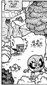
Fig. 1. Panel 4 from Table 1. Credit [4]