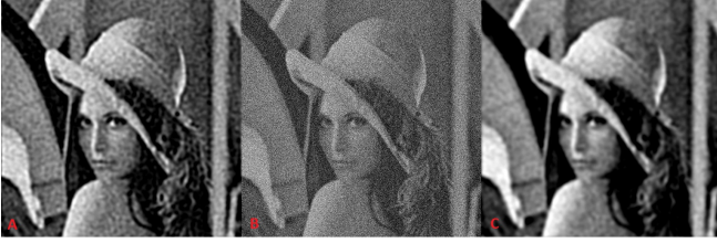
Fig. 2: Myopic deconvolution of an image blurred by a Gaussian with FWHM \gamma = 2 pixels and with SNR = 8 dB. A: result with finite difference regularization, cf. Eq. (23), and GML parameter estimation. B: result following method in [11]. C: result with same regularization as in B, cf. Eq. (29), but with GML parameter estimation.

to speed-up the computations of the exact criterion. The DFT approximation is however much faster 1 , so we favor the use of our DFT-based method.