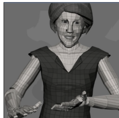
Figure 3: Rendering

The whole workflow ends with a rendering of the virtual signer signing the output sentence. The rendering must be high fidelity (motion-wise) but not necessarily photorealistic. The most important issue is to play back accurately each sign language parameter in order to be properly understood by deaf final users.