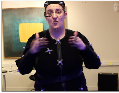
Figure 1: Motion capture session

this video with the Elan software [2]. Sentences are segmented into signs, labelled by a string conveying its meaning. Other meta-data can also be added to the segments about handshape, face expression, body posture, or any other feature that may be relevant to choose a good sign variant when creating new utterances.