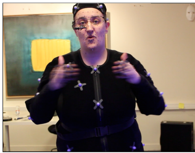
Figure 1: Motion capture session

this video with the Elan software [2]. Sentences are segmented into signs, labelled by a string conveying its meaning. Other meta-data can also be added to the segments about handshape, face expression, body posture, or any other feature that may be relevant to choose a good sign variant when creating new utterances.