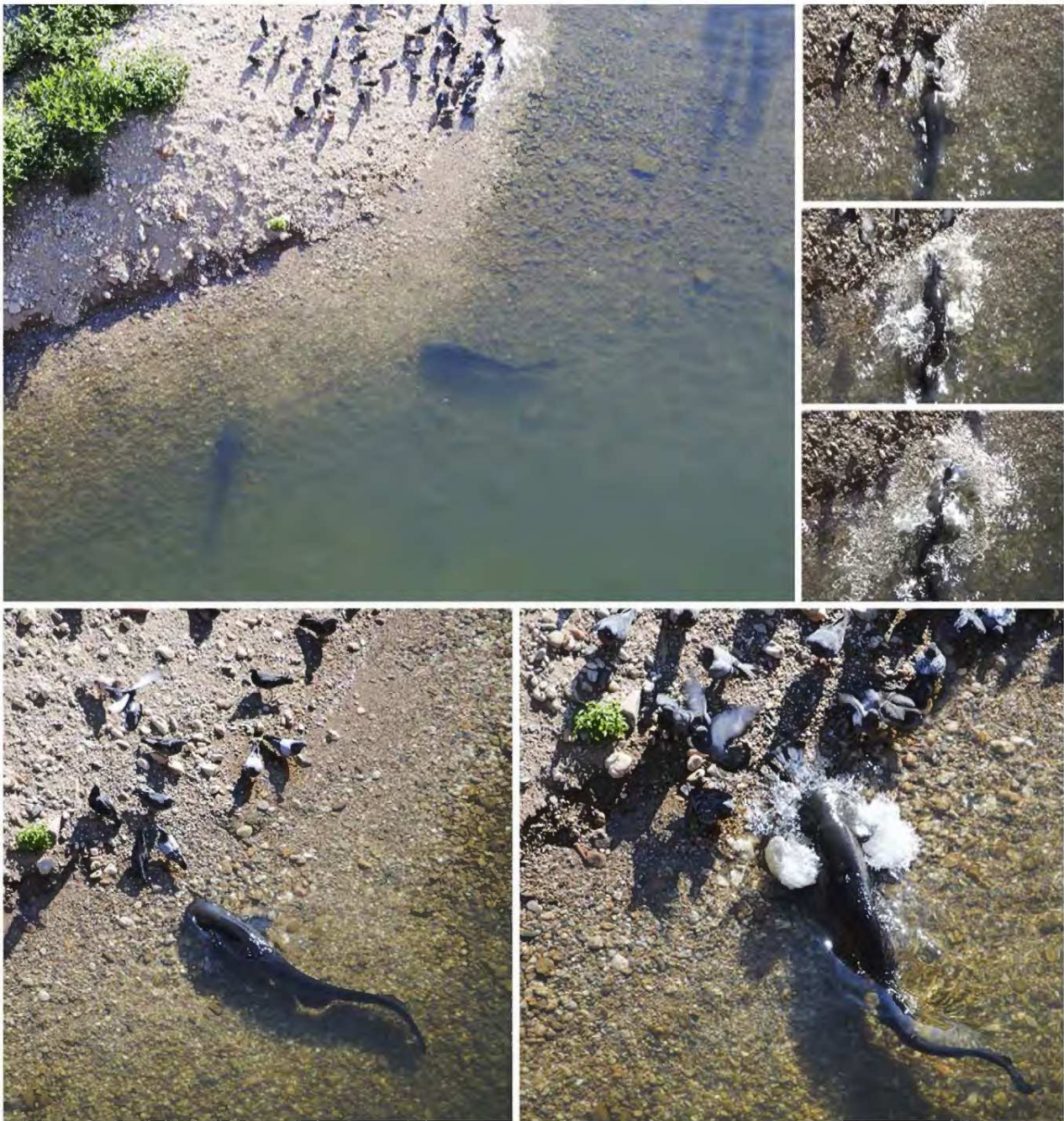
Figure 1. European catfish displaying beaching behavior to capture land birds. Several individuals were observed swimming nearby the gravel beach in shallow waters where pigeons regroup for drinking and cleaning (large picture). One individual is seen approaching land birds and beaching to successfully capture one (small pictures).

gravel island. Throughout the survey, river discharge was low and the water was clear, allowing full observation of all displayed behavior (Figure 1 and Movie S1).