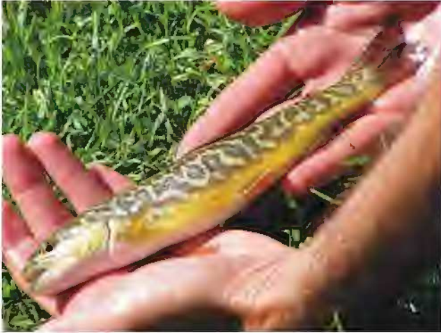
Fig. 4 S. trutta × S. fontinalis hybrid (tiger trout, total length=205 mm, weight=78.6 g) captured in the Oriège River in 2005

(Essington et al. 1998) might explain partially hybridization behavior observed here.