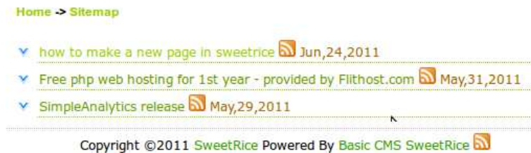
Figure 2. Sitemap of SweetRice which contains a list of all articles

1 // comments in sweetrice are labeled #1, #2, etc 2 HtmlElements referenceElements = browserSource.query(clickable("#")).find(); 3 for (HtmlElement referenceElement: referenceElements) { 4 HtmlElement commentInfoElement = browserSource.query(rightOf( referenceElement), text()).findFirst(); 5 HtmlElement commentTextElement = browserSource.query(rightOf( commentInfoElement), text()).findFirst(); 6 7 String commentAuthor = commentInfoElement.getTextFirstLine(); 8 Date commentDate = commentInfoElement.extractDate(); 9 String commentText = commentTextElement.getText(); 10 }