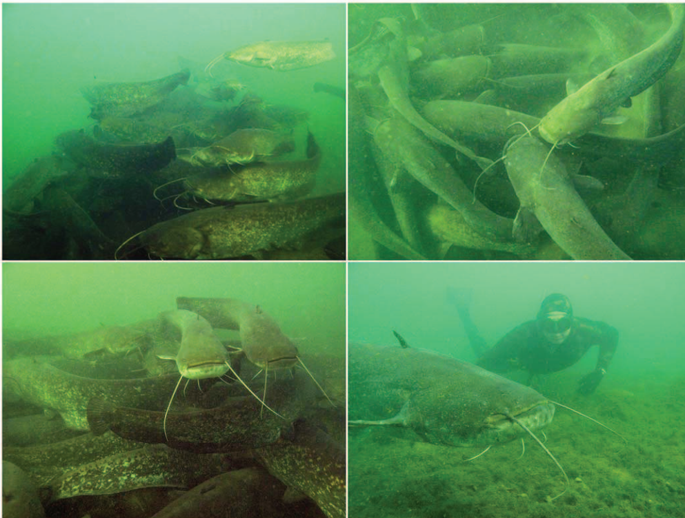
Figure 1. Wels catfish ( Silurus glanis ) aggregations. Bottom-right panel illustrates the size of Wels catfish in the aggregation. doi:10.1371/journal.pone.0025732.g001

one location while defecating in another [7,8]. Additionally, heterogenous spatial distribution of fish can also create biogeochemical hotspots, i.e. places where nutrient release by animals exceeds the need of primary producers [9].