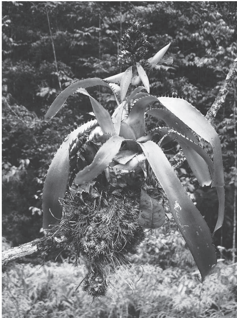
PLATE 1. The tank-bromeliad Aechmea mertensii , rooted on a Pachycondyla goeldii ant-garden covered with moss.

resources, surrounding landscape, etc., tank-bromeliads have proven to be relevant model systems for studying the associations between the biodiversity of phytotelm communities (including biological interactions and functional processes) and these gradients in tropical environments (Richardson et al. 2000, Armbruster et al. 2002). Previous studies have highlighted the role of the container's characteristics (complexity, age) and direct biological interactions (food webs) in shaping invertebrate communities (reviewed in Kitching [2001]). While these studies focused on the diversity of aquatic communities, the indirect role of the terrestrial animals associated with the bromeliads in mediating phytotelm biodiversity has not been considered so far. Hence, our findings shed new light on how a two-species mutualism can affect much larger segments of the invertebrate community in tropical rain forests. Interestingly, the