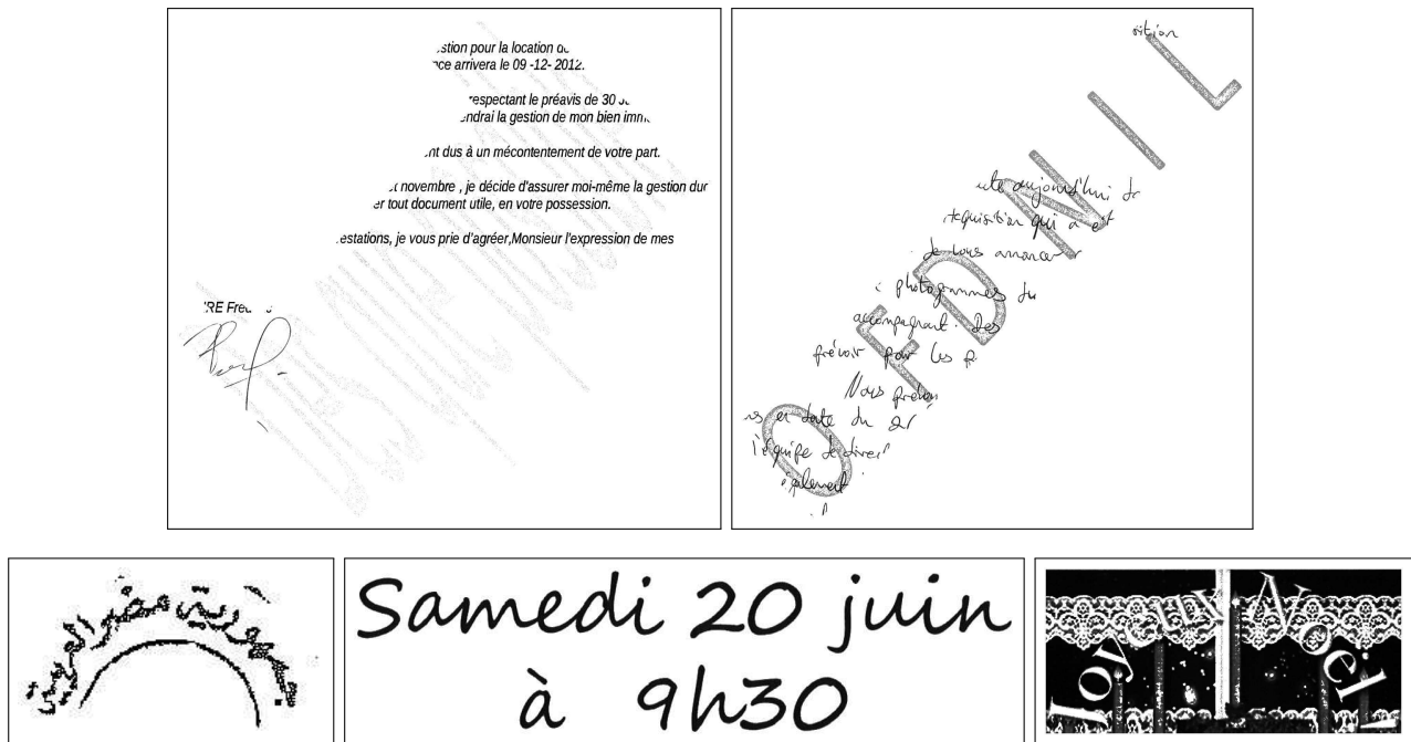
Figure 5. Difficult samples from the Maurdor campaign datasets (mixed, twisted, hand-like printed, background...)