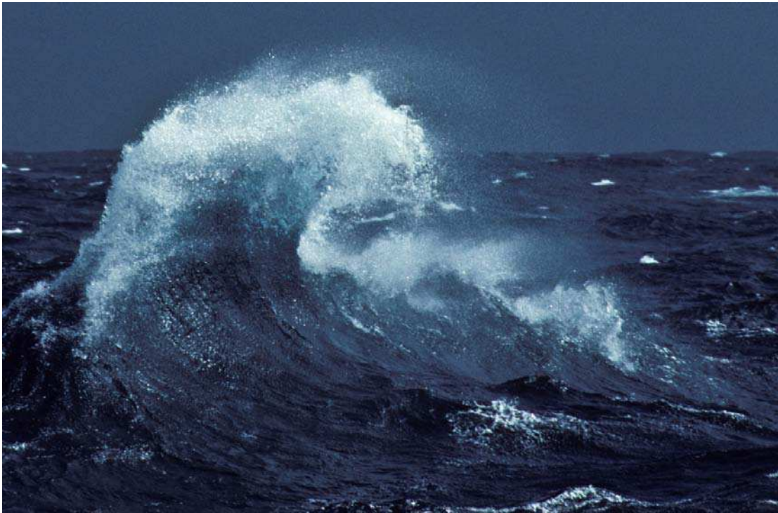
Figure 1 (a) The Great Wave off Kanagawa (Kanagawa-oki nami-ura) woodcut by Katsushika Hokusai. (b) Photograph of a breaking wave in the sub-Antarctic waters of the Southern Ocean taken from the French research vessel Astrolabe during one of its regular voyages between Hobart and the Dumont d'Urville Station in Adélie Land (V. Sarano, 1991). Note the transverse and longitudinal localization of the wave that is remarkably similar to that depicted by Hokusai.