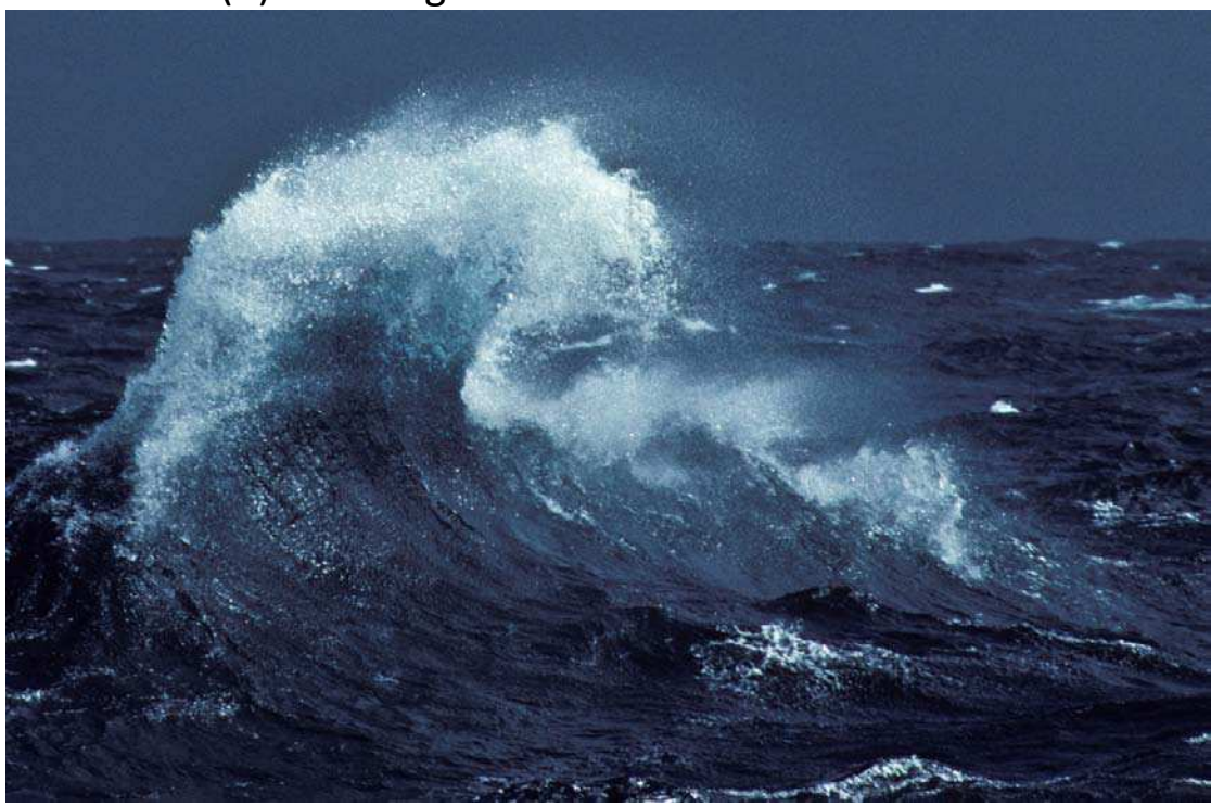
Figure 1 (a) The Great Wave off Kanagawa (Kanagawa-oki nami-ura) woodcut by Katsushika Hokusai. (b) Photograph of a breaking wave in the sub-Antarctic waters of the Southern Ocean taken from the French research vessel Astrolabe during one of its regular voyages between Hobart and the Dumont d'Urville Station in Adélie Land. Note the transverse and longitudinal localization of the wave that is remarkably similar to that depicted by Hokusai.