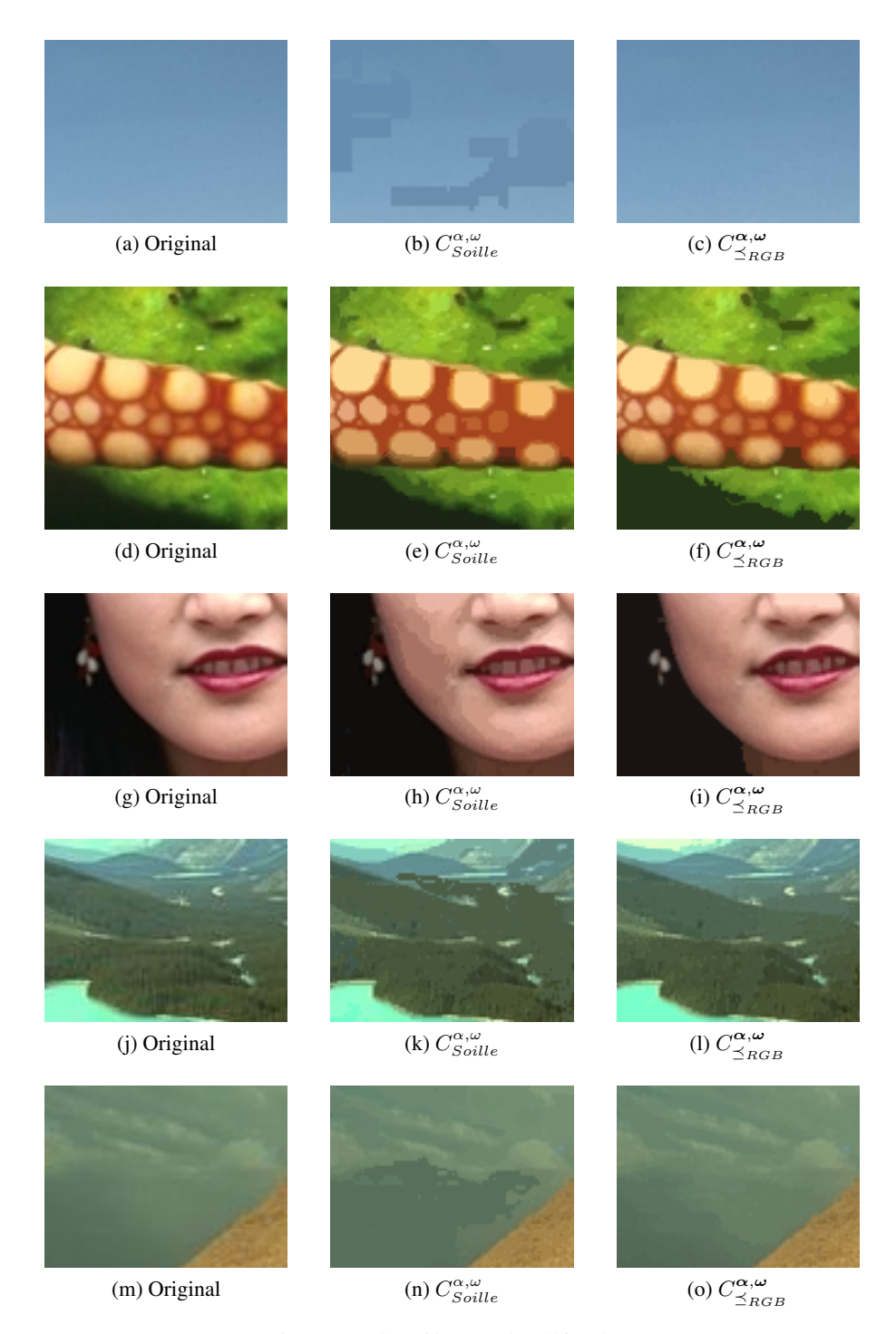
Fig. 2: Details of image simplification.