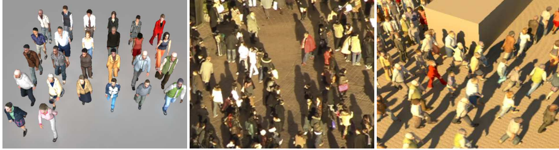
Figure 2. Crowd Rendering. From left to right: the 26 different avatars used to produce the videos (their choice has been made to exhibit the maximum variability w.r.t. age, sex and cloths style); a real image from a video footage of Shibuya in Tokyo; a crowd rendering with similar day light conditions