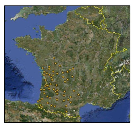
Fig. 1. Location of the 61 ground stations measuring GHI in the South-West quarter of France.