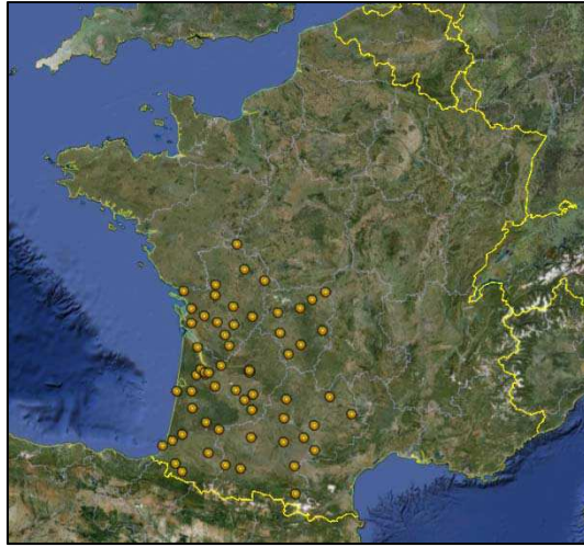
Fig. 1. Location of the 61 ground stations measuring GHI in the South-West quarter of France.