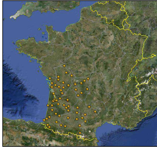
Fig. 1. Location of the 61 ground stations measuring GHI in the South-West quarter of France.

them measured in the past the direct component of the SSI and, presently, only one is still measuring it. The analysis presented below focuses on the South-West quarter of the country (130,132km 2 , 20% of the territory) whose irradiance level is suitable to PV project and where 61 ground stations measure this component ( cf. Fig 1).