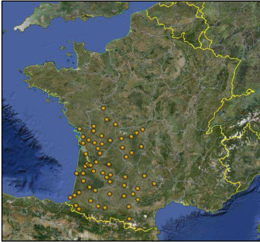
Fig. 1. Location of the 61 ground stations measuring GHI in the South-West quarter of France.

them measured in the past the direct component of the SSI and, presently, only one is still measuring it. The analysis presented below focuses on the South-West quarter of the country (130,132km 2 , 20% of the territory) whose irradiance level is suitable to PV project and where 61 ground stations measure this component (cf. Fig 1).