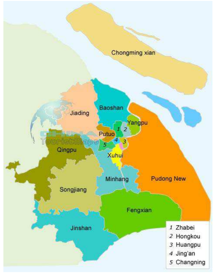
Map of Shanghai districts

To make these projects feasible, satellite cities need to foster better coordination in order to limit competition among them.