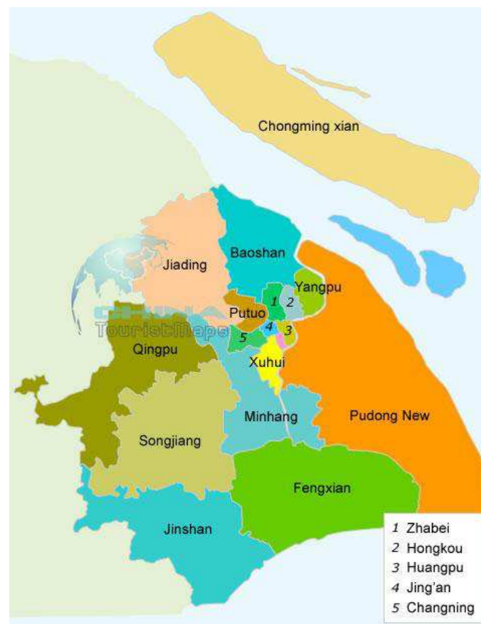
Map of Shanghai districts

To make these projects feasible, satellite cities need to foster better coordination in order to limit competition among them.