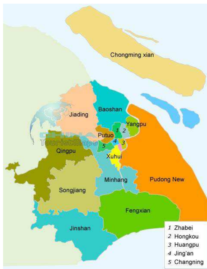
Map of Shanghai districts

To make these projects feasible, satellite cities need to foster better coordination in order to limit competition among them.