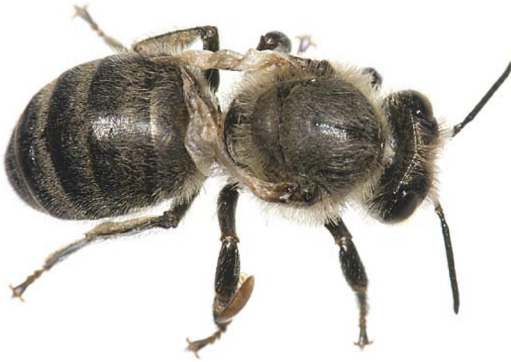
Figure 1. Non-viable, adult bee ( Apis mellifera ) exhibiting deformed wings as clinical symptom of an overt DWV infection. A V. destructor individual is still clinging to one of the legs. (A color version of this figure is available at www.vetres.org .)