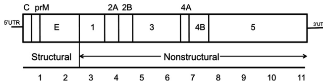
Figure 1. Genomic organization of the WNV genome. Three structural proteins (C, prM, E) and seven nonstructural proteins (NS1, 2A, 2B, 3, 4A, 4B and 5) are translated as a single polyprotein directly from the 11 Kb positive-sense RNA genome.

proteins necessary for encapsidation of the viral RNA and the surface proteins required for viral receptor interaction and fusion with host cells (Fig. 1) [76]. The remainder of the genome encodes the nonstructural proteins that form the viral replication complex for the generation of negative-sense template RNA as well as positive-sense genomic RNA [161]. The largest of the NS proteins, NS3 and NS5, have been characterized for interactions and replicase activity; however, the function of the remaining NS proteins is largely unknown. The NS5 protein has both RNA polymerase and methyltransferase motifs necessary for viral replication. Helicase and serine protease domains have been described for the NS3 protein [129]. Interestingly, the NS1 protein is a secretory nonstructural protein that does not have a designated function in RNA replication or as a control element [162].