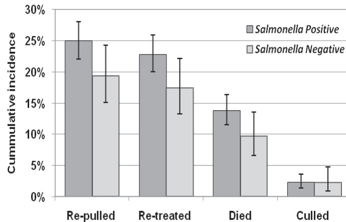
Figure 2. Cumulative incidence of adverse health outcomes occurring during the feeding period for feedlot cattle that were previously identified as positive or negative for Salmonella based on fecal culture at initial treatment for apparent respiratory disease. Percentages were derived from probability estimates from logistic regression models accounting for the arrival lot of each individual.