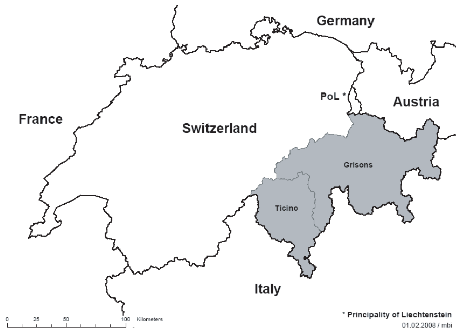
Figure 1. Map of Switzerland with the adjacent countries.

the CLIN-SSC depends on the disease awareness of the farmer and the veterinarian and on the tuberculin test sensitivity (Fig. 2a). The key SSC for bovine tuberculosis consists of the detection of visible lesions (VL) in the slaughterhouse (SLI) and further diagnostic procedures initiated by the meat inspector (Fig. 2b). Given that an infected animal shows visible lesions detectable post mortem, the awareness and the accuracy of the meat inspector is a crucial point for the sensitivity of this SSC [2, 11]. Because bTB is a zoonosis and can be transmitted from cattle to people, human Mycobacterium bovis cases are indications of the presence of infected cattle. Therefore, each human bTB case should trigger a follow-up to rule out bTB in cattle (Fig. 3). The crucial points in this passive SSC based on human surveillance (HS) are the disease awareness of medical practitioners and the reporting of human bTB cases to the State Veterinary Service in order to conduct follow-up examinations of suspect cattle farms.