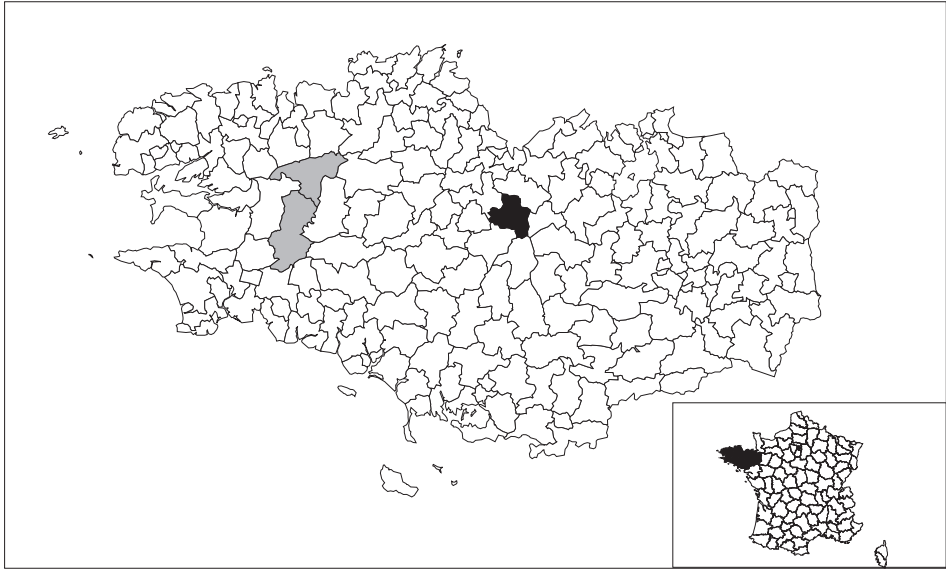
Figure 1. Map of Brittany, localisation of the selected areas: densely populated pig area (canton of Plouguenast) and sparsely populated pig area (cantons of Huelgoat and Chateaufort du Faou).

of individuals with data grouped within a table (Individuals \times Variables) and where variables are categories, whereas they are continuous in Principal Component Analysis. This typology is based on a distance principle, so that the closer the individuals are to each other, the larger are the number of categories they share together.