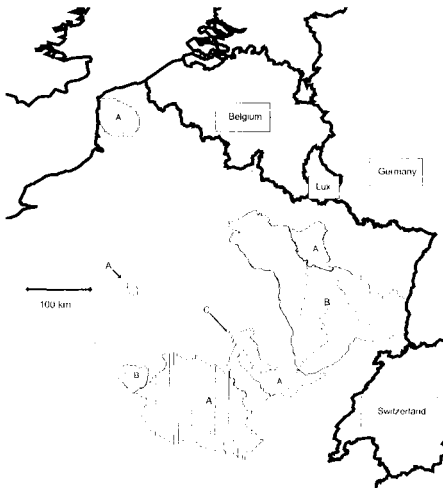
Figure 2. Areas vaccinated for the first time with the Raboral VRG bait during the spring (A), summer (B) or autumn (C).