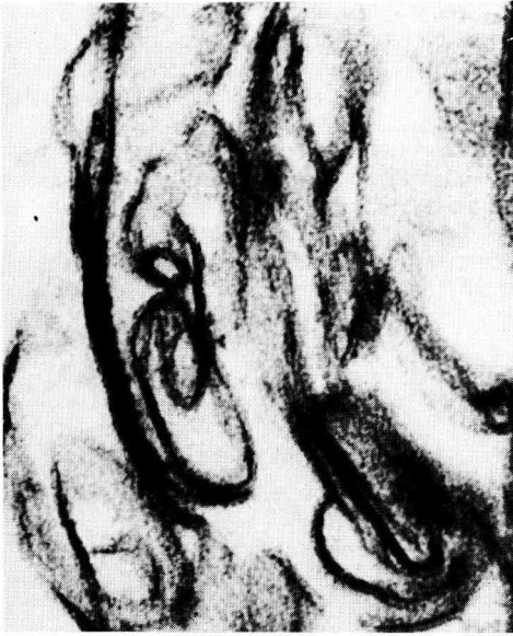
Fig. 2. — Ultrathin section of SDS-I fraction of B. abortus 99 (S). The dense layer (5 nm) is well observed with a thin layer (2.5 nm) at 2.5 nm apart. X 124 000.