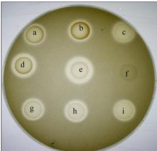
Figure 1. Tyrosine production medium (TPM) to detect tyrosine decarboxylating enterococcal strains. a, E. faecalis KH 12; b, E. faecium DH 28; c, E. faecium RH 31; d, E. faecium RH 33; e, E. faecalis NCDC 114 (positive control); f, L. lactis subsp. cremoris NCDC 61 (negative control); g, E. faecium RH 38; h, E. faecalis KH 62 and i, E. faecalis KH 67.

Sample preparation involved centrifugation of the broth, filtration through a 0.22 \mu\text{m} filter and derivatized with orthophthalaldehyde. Finally, the sample was injected into the port of the HPLC system (Shimadzu Corporation, Kyoto, Japan), equipped with a UV detector and an intelligent pump. HPLC separation was performed on a \text{C}_{18} (2) column ( 250 \times 4.60 mm, 100 \text{\AA} , particle diameter 5 \mu\text{m} ) that was purchased from Phenomenex (Macclesfield, Cheshire, UK). A gradient elution was used comprising two buffer systems, viz: (i) 0.1 \text{mol}\cdot\text{L}^{-1} ammonium acetate buffer, pH 7.3 (buffer A) and acetonitrile (buffer B). The eluant gradient began with 45% 0.1 \text{mol}\cdot\text{L}^{-1} ammonium acetate and 55% acetonitrile and ended with 10% 0.1 \text{mol}\cdot\text{L}^{-1} ammonium acetate and 90% acetonitrile for 11 min at 40 ^{\circ}\text{C} oven temperature with the flow rate of 1 \text{mL}\cdot\text{min}^{-1} . The detection was done at the wavelength of 254 nm. Standard tyramine was purchased from HiMedia