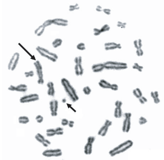
Figure 3. (a) GTG-banding karyotype of a boar carrier of the t(Y;14)(q10;q11) reciprocal translocation. (b) Metaphase spread of the boar conventionally stained with Giemsa.