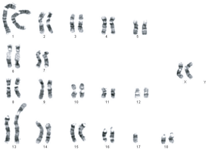
Figure 2. GTG-banding karyotype of a gilt carrier of the 13/17 Robertsonian translocation.

NB: The rearrangement was initially identified in a boar; daughters were produced for experimental purposes.