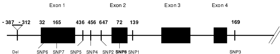
Figure 2. Polymorphism identified in the horse MATP gene. Exons are represented by black boxes and introns and UTR by lines. The relative positions of SNP are indicated. Exon and intron nucleotides are numbered from the first nucleotide of each exon or intron. Figure not drawn to scale.

SNP were searched in the mean time in introns and exons of the MATP gene by sequencing regions flanking the seven exons. Three SNP in the first intron (SNP2, 4 and 5), one SNP in the second intron (SNP1), and one SNP in the fourth intron (SNP3), as well as a 75 bp deletion upstream of the first exon (Fig. 2, Tab. V) were identified.