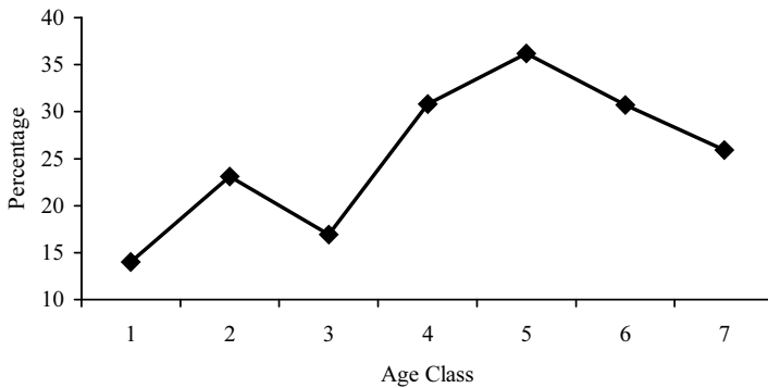
Figure 1. Linear model solutions for age effect on spontaneous, out-of-season ovulatory activity; 1 = young ewes that had never lambed before; 2 = older ewes that had not lambed in previous season; 3, 4, 5, 6, 7 = ewes that lambed for the 1st, 2nd, 3rd, 4th, and 5th or greater time, respectively, in the previous season.