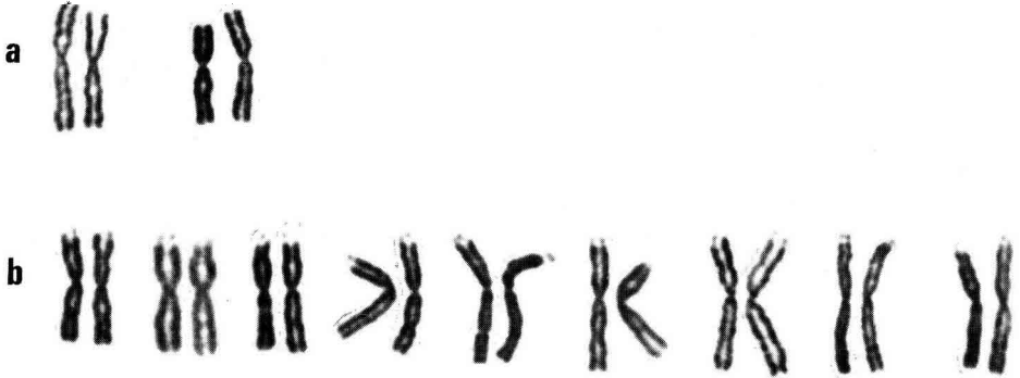
Fig 2. BrdU-induced fragile sites at the distal end of Xp. a. normal X chromosomes. b. fraX chromosomes.

site associated with mental retardation. The reindeer fraX, however, is a common BrdU-induced fra site. As far as it is known, the reindeer with fraX are normal in their appearance as well as in their behavior.