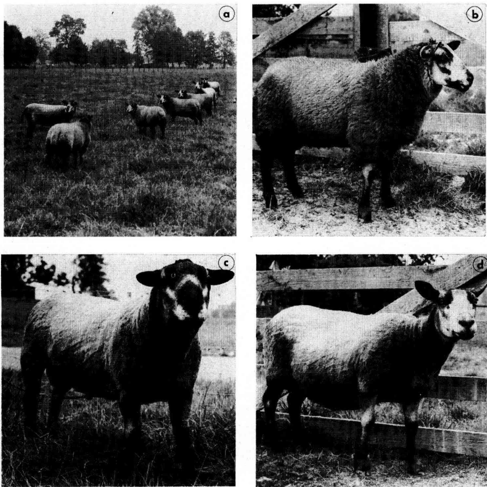
FIG. 1. — « Blue » sheep at Mr VAN LAAR's farm, Woudenberg (Utrecht).

At birth the belly of the blue animal is rather dark, the dark colour extending backwards to the innerside of the hind-legs, up around the anus and the thighs. The dark colour extends forwards along the brisket to the inner side of