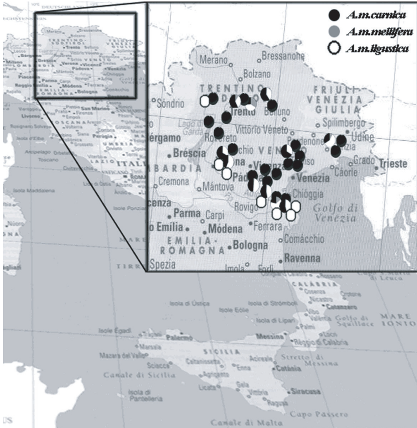
Figure 2. Detail of the individual analysis of samples from the North-east group. A. m. carnica alleles are largely present in the Veneto region.

to either or both natural migration and transport by beekeepers.