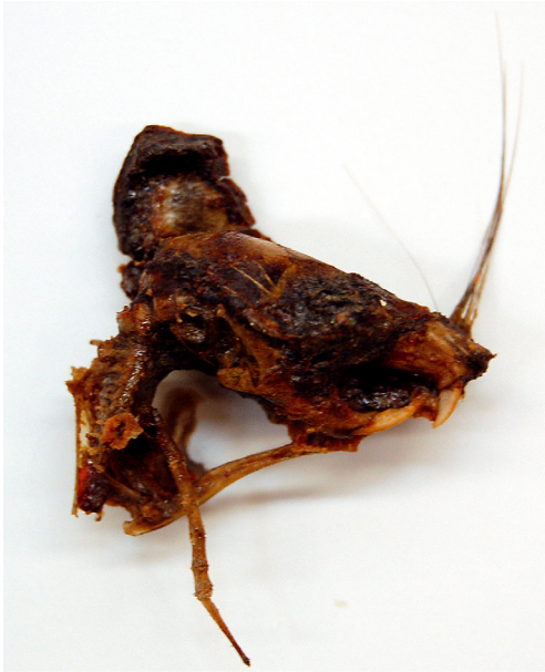
Figure 2. A mouse skull that was encased in propolis found within a honey bee colony in an apiary of the University of Minnesota. If a colony intruder has been killed within the hive and is too large for the bees to remove, they will embalm it using propolis to prevent the corpse from decaying.

with Varroa , propolis extracts caused larval mortality and reduced metabolic rates of wax moth larvae and adults (Garedew et al., 2004). The implication here is that contact or possibly volatile emissions from propolis may reduce the ability of the moths to effectively reproduce and develop within a hive.