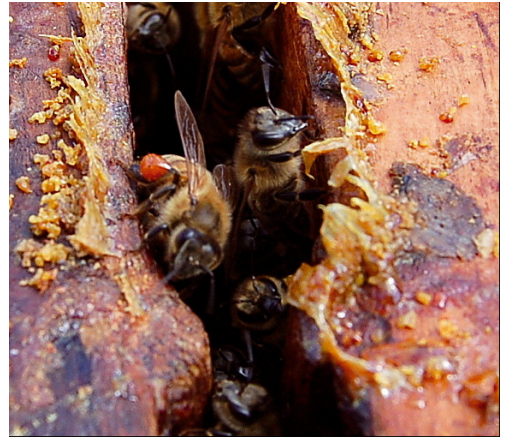
Figure 4. As a resin forager returns to the nest with a load of resin on her corbicula, they go deep into the hive at a “cementing” site, where the resin will be used. Pictured in a colony located at the University of Minnesota, a resin forager within a hive must wait for other bees to remove the resin from her hind legs. Propolis is used in this area and can be seen here on the tops of the two frames.

Once the bees find the resin source, they then have to collect it. Huber (1814), Haydak (1953), and Meyer (1956) have described this