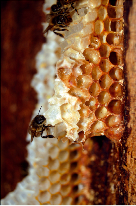
Figure 3. Particularly in feral colonies nesting in tree cavities, honey bees secure the site of comb attachment on the hive wall with propolis. In some cases, as can be seen here (same feral colony as in Fig. 1), the rim of comb cells will also have a thin coating of propolis. The function and significance of this behavior is currently unknown.

Future research should also be directed toward the natural use of propolis by honey bees as a disease resistance mechanism. Propolis will occasionally be used for tasks other than smoothing hive walls and reducing entrances. Huber (1814) observed honey bees embedding strands of propolis in cleaned and polished cells. Ribbands (1953) believed that bees used propolis in this manner to prevent disease transmission when reusing cells. It is unclear how common this behavior is, but at least feral colonies can be found with propolis on the rims of cells (Fig. 3). Recent evidence also indicates that honey bees may “entomb” chemically contaminated pollen in cells with propolis, but the frequency of this behavior and subsequent effect on colony health is currently unclear (vanEngelsdorp et al., 2009).