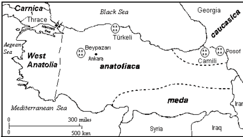
Figure 1. The native honeybee subspecies ( A. m. anatoliaca , A. m. caucasica , A. m. carnica and A. m. meda ) and the genotype of West anatolia (Aegean) were determined by Ruttner (1988). Samples of this study were collected from which are indicated by an asterisk (*) (Adapted from Smith et al., 1997).

However, there has been no other legislation with respect to which subspecies or ecotype is suitable to what region. Queens and colonies reared from different honeybee subspecies ( A. m. caucasica , A. m. anatoliaca ) have been sold without control for regions with native geographic subspecies. The same is true for other regions and bee subspecies. It is known that native honeybee subspecies and ecotypes might have lost their characteristics because of hybridisation caused by migratory beekeeping, commercial queen bee usage, and uncontrolled mating (Rinderer, 1986; Ruttner, 1988b; Moritz, 1991; Kauhausen-Keller et al., 1997; Lodesani and Costa, 2003; Moritz, 2004). The mixing of the native subspecies has occurred because beekeepers prefer different races for their higher productivity. It is thought that the level of mixing caused by commercial queen-bee usage is particularly high because of the haplodiploid genetic structure of honeybees (Rinderer, 1986; Poklukar and Kezic, 1994); one queen bee can lay about 4 to 5 thousands unfertilised eggs in each season, which all develop into drones (male sexuals). In addition, because they are haploid, one drone can produce 10 million of spermatozoa that are genetically identical to each other. However, there is no information on the effect