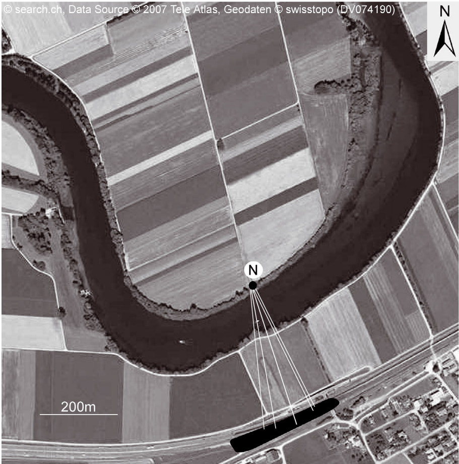
Figure 2. Area with open water and a motorway for the mark-recapture study with Hoplitis adunca in western Switzerland. The artificial nesting site close to the river is labelled with the letter N. The black area shows the Echium vulgare stand on the roof of an underpass covering half of the motorway. White lines indicate the foraging flights of the recaptured females.

for field crops in western Switzerland near Selzach, Solothurn (47° 11' 63" N, 7° 27' 78" E, elevation 420 m), which is crossed by the river Aare (Fig. 2).