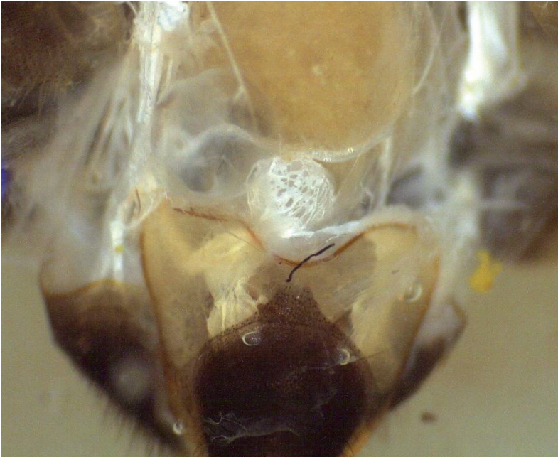
Figure 1. The developed worker spermatheca of A. m. capensis is invested with a tracheolar net and the spermathecal gland is connected to the oviduct.