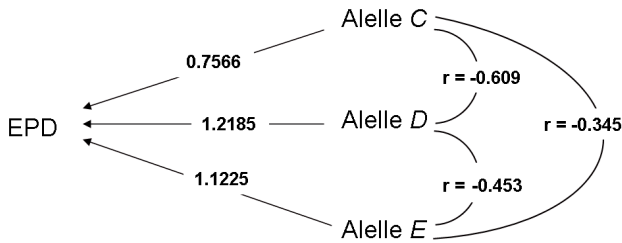
Figure 2. Path analysis diagram showing the direct effects of C , D and E mrjp3 alleles and their inter-relations ( r = correlations) in the EPD for royal jelly production in Africanized honeybee colonies.

the mrjp3 repetitive region influences the genetic value of the queen for RJ production. The variance analyses for the mrjp5 repetitive region and mrjp8 loci were not significant, giving indications that these loci probably have low effect on the genetic value for the RJ production (Tab. II).