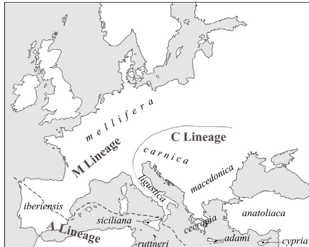
Figure 1. Approximate natural distribution of the Apis mellifera evolutionary lineages and subspecies in Europe.

confirmed as evolutionary lineages, with slight modifications; subspecies such as A. m. intermissa and A. m. sahariensis are now included in the African A lineage (Cornuet and Garnery, 1991), and the subspecies A. m. anatoliaca and A. m. caucasica that were originally grouped in the oriental ‘O-branch’, together with A. m. meda , A. m. syriaca , A. m. adami , A. m. cypria and A. m. armeniaca , have now been included in the evolutionary C lineage (Smith et al., 1997; Franck et al., 2000b). Still some controversy exists in this grouping of subspecies to evolutionary lineages. For example, A. m. cypria from Cyprus has been recently grouped into the O branch based on morphology, and into the C lineage based on molecular markers (Kandemir et al., 2006).