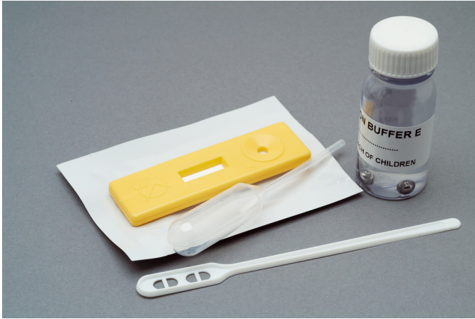
Figure 1. The contents of an EFB LFD field kit.