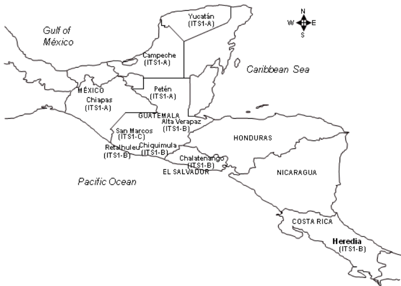
Figure 3. Geographical distribution of the RFLP patterns ITS1-A, ITS1-B and ITS1-C found in M. beecheii .

from ca. 1720 to ca. 1670 so, excluding the flanking conserved regions of the 18S and 5.8S genes, the total size of the complete ITS1 region was about 1520 bp in the Mexican and northern Guatemala specimens, 1469 in those from southern Guatemala, El Salvador and Costa Rica and 1457 in the specimens from San Marcos (Guatemala). The size is within the range observed in other species