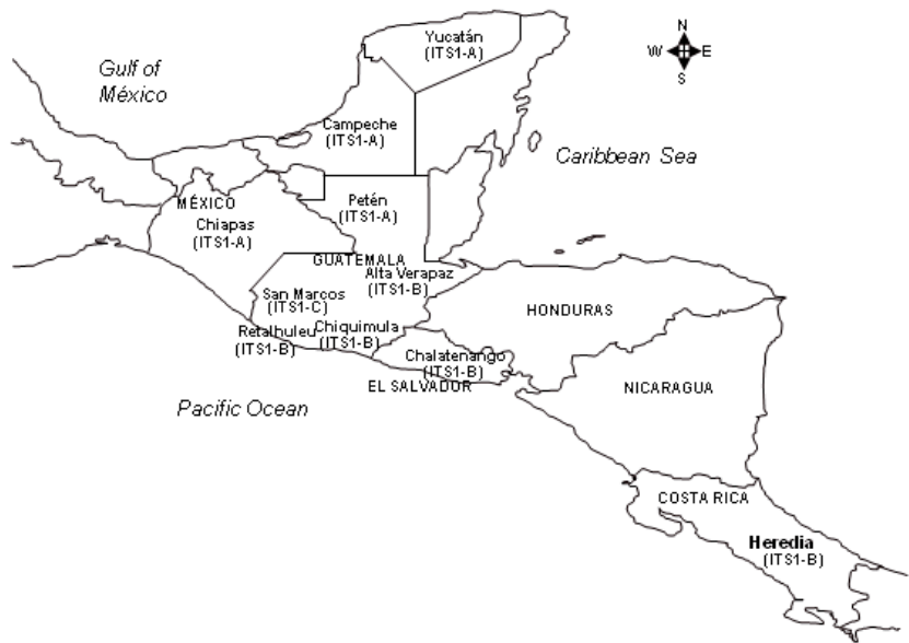
Figure 3. Geographical distribution of the RFLP patterns ITS1-A, ITS1-B and ITS1-C found in M. beecheii .

from ca. 1720 to ca. 1670 so, excluding the flanking conserved regions of the 18S and 5.8S genes, the total size of the complete ITS1 region was about 1520 bp in the Mexican and northern Guatemala specimens, 1469 in those from southern Guatemala, El Salvador and Costa Rica and 1457 in the specimens from San Marcos (Guatemala). The size is within the range observed in other species